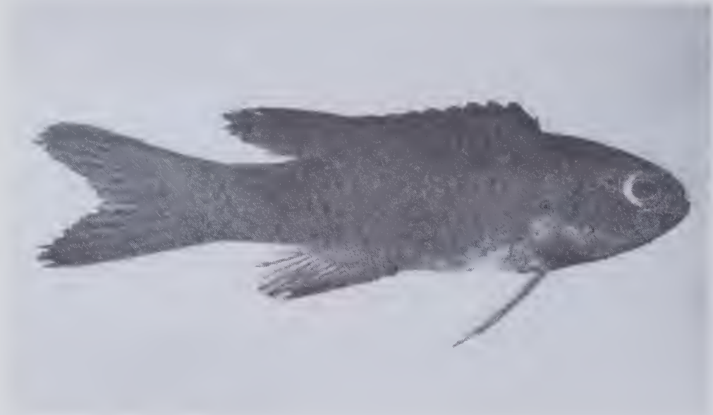
Fig. 4. Assessor randalli , holotype, 32.5 mm SL, Ishigaki, Ryukyu Islands.